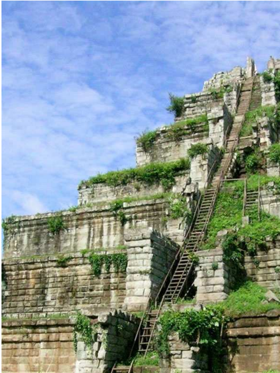
Fig. 3 10th Century Temple of Prasat Thom, Koh Ker, Northern Cambodia.