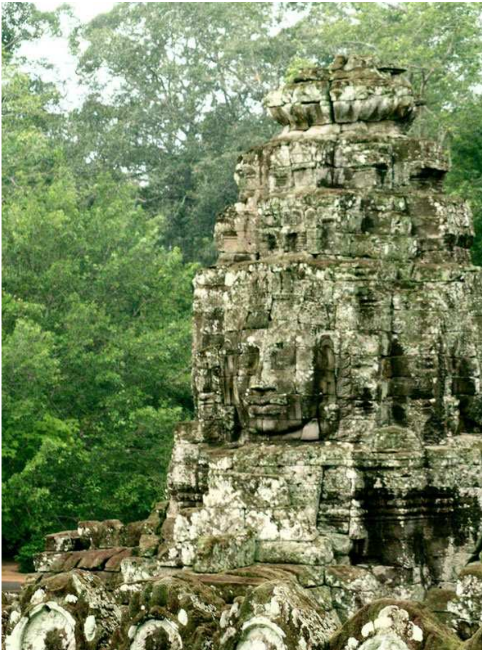
Fig. 2 The Bayon temple, Ankgor Wat.

New York [36]. 19 The latter is home to the section's regular ancient art auctions, which began in 1988. Nearly all of these sales—which usually take place once to twice a year—have included Khmer antiquities. 20 Their catalogues therefore provide an excellent starting place for examining the wider international market for Cambodian art. 21