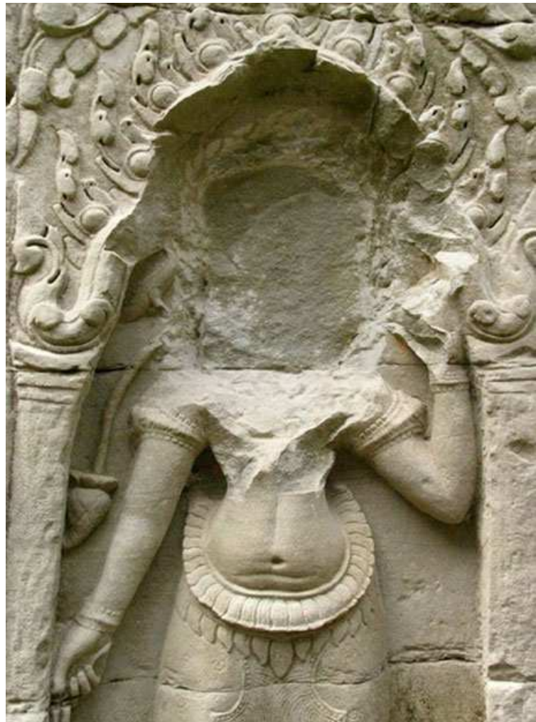
Fig. 6 Looted statue, Preah Vihear, Angkor Park. Tess Davis, 2005