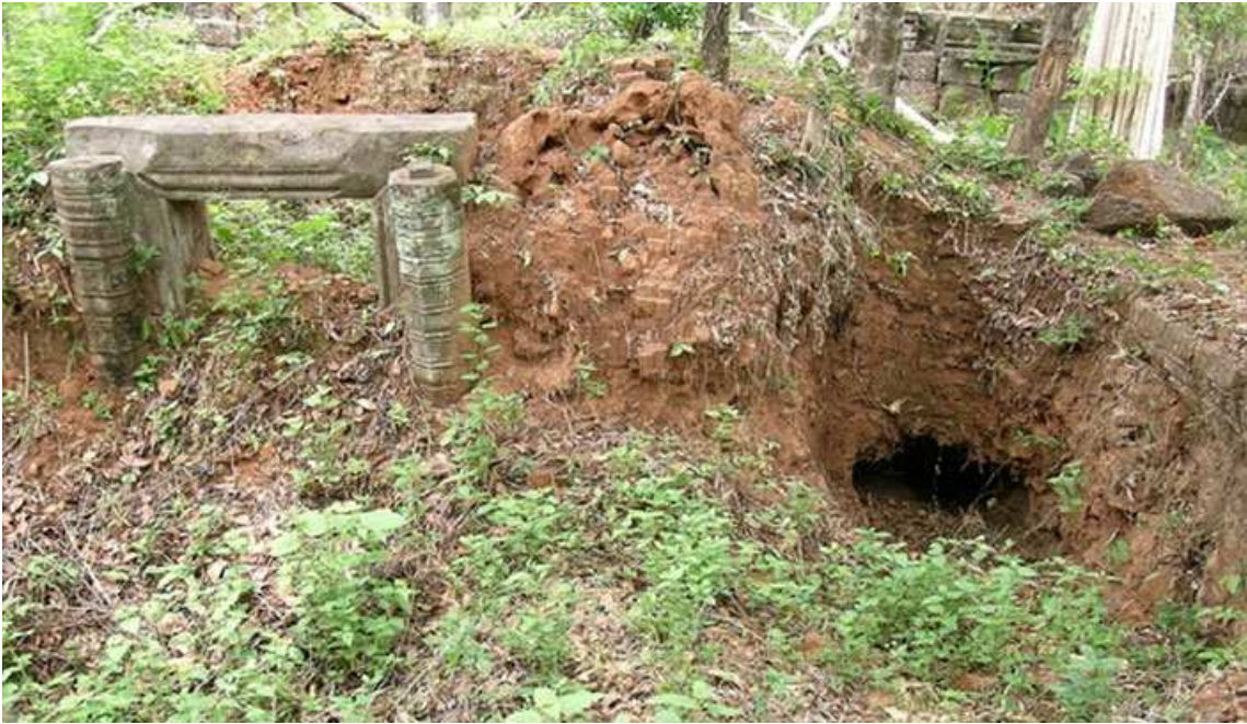
Fig. 5 Looters' Pit, Koh Ker, Northern Cambodia. Photograph by Tess Davis, 2005