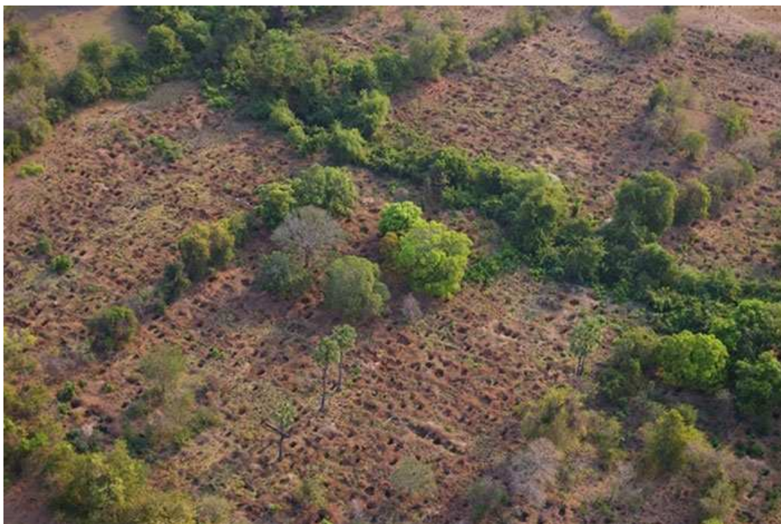
Fig. 4 Looters' Pits, Northwestern Cambodia.

ranged from US$400 to US$600,000, with an average of approximately $17,000 to $24,600. 23