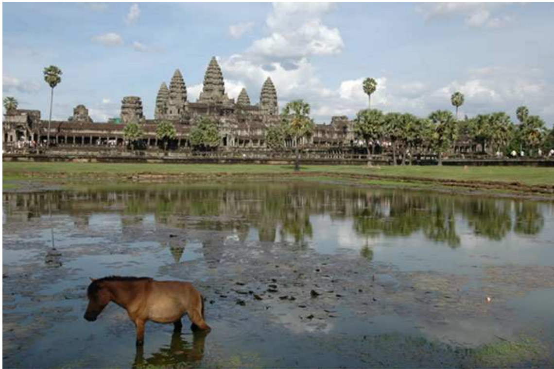
Fig. 1 Cambodia's most famous temple—and ancient capital—Angkor Wat

Looting in Angkor: One Hundred Missing Objects , a 1993 report of UNESCO's International Council of Museums (ICOM), which pleaded for the return of 100 valuable antiquities stolen from the Conservation d'Angkor in the 1980s and early 1990s. 17 In his exposé Sotheby's: The Inside Story (1997), journalist Peter Watson uncovered that sculptures from Angkor Wat had been smuggled into Sotheby's London offices disguised as “dolls” and “stone torsos,” on at least two separate occasions (p. 254).